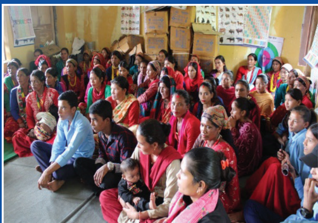
Community meeting in Gadraye, Bajhang

At the meeting women who were practiced safe menstrual practices like setting in side home and eating dairy product during menstruation were explored. Some of the women were found in Bajhang who were sit inside home and consume dairy and some women were committed to change their practice towards safe menstruation