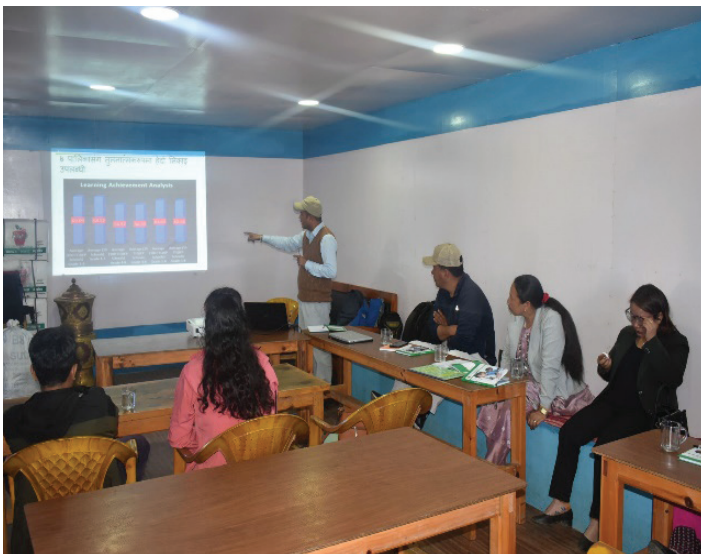
MPAC Meeting at Solududhkunda Municipality