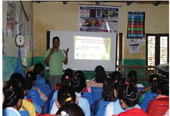
Video voice training on child right and cyber-crime in Bajhang