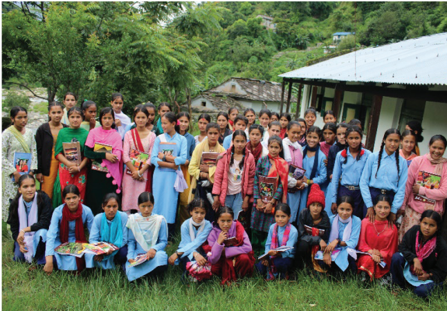
Video voice training on child right and cyber-crime in Bajura

with them. Most of the girls were not aware of these terminologies so focused to make them familiar with these terminologies. Impact of cybercrime in human life also explained to them along with examples. Where to contact and how to contact for cybercrime also discussed in the session.