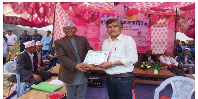
West Nepal: Sambredhee Khaptad Channa Project appreciated by the Khaptad S.S, Bajhang

At the end of the program, the Rural Municipality had also provided certificate of appreciation to REED Nepal team for the excellent contribution in health and education sector of Khaptad Channa Rural Municipality.