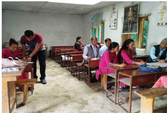
Workshop at Padmakanya BS, Mapya Dudhkoshi RM, Solukhumbu

This workshop amongst the teachers received training from TTQIEP and the teachers yet to be received training was the ideal activity. The main purpose of the sharing activity was to reflect on their ideas for the upliftment of the Learning achievement of the students. Altogether at 11 schools, this activity was conducted in the first quarter. A total of 78 trained teachers (Male-45, Female-32, and PwD Male-1) and 59 untrained teachers (Male-41, Female-17, and PwD Male-1) participated.