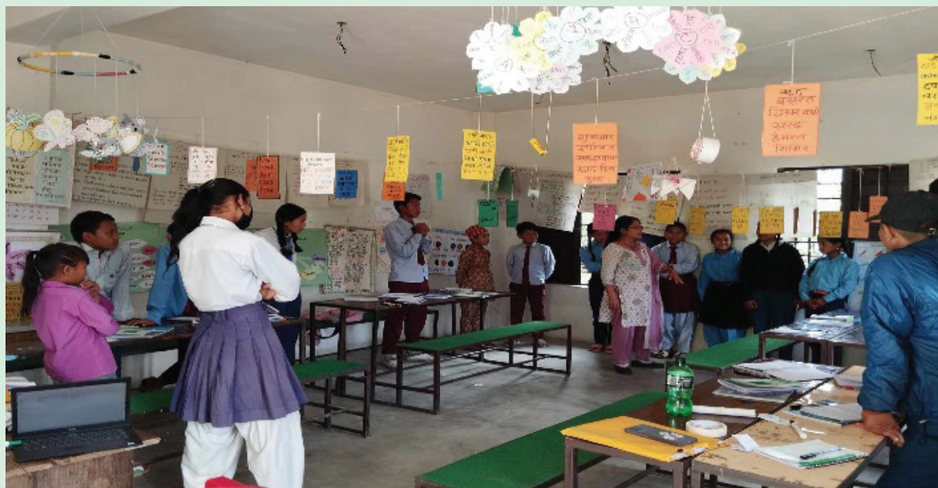
Child-Club Training at Mapya Dudhkoshi RM

This training was conducted in the four local-level units (Mapya Dudhkoshi, Sotang, Mahakulung & Nechasalyan RM). A total of 191 participants were benefitted from that training. A total of 191 participants were benefitted from that training.