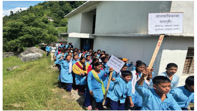
Students during the rally