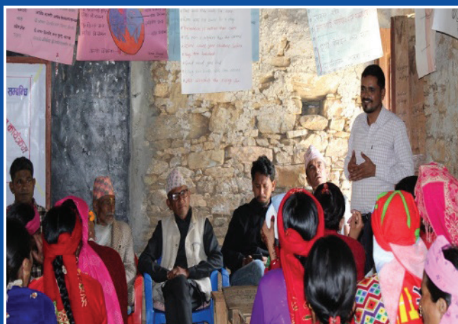
Community meeting in Bajura